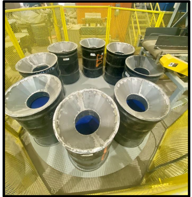
30 or 5 Gallon Drum Conveyor Funnel